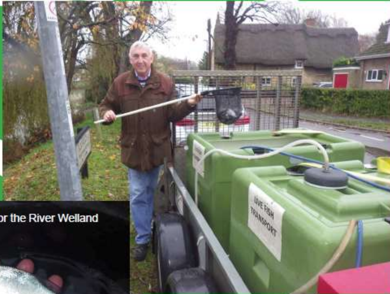
Calverton bream for the River Welland