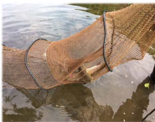
These pictures show a legally (tagged) eel net on the left and an illegal eel net on the right.

Reel experts buy online gov.uk/get-a-fishing-licence